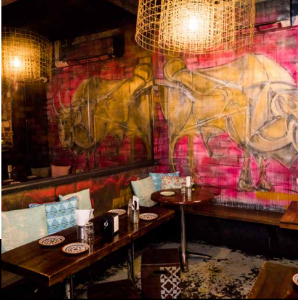
Private Back Room

You'll find a number of spaces to suit your special occasion. Limited seating configurations apply to some spaces. Regardless of the space you choose, there is no venue hire fee.