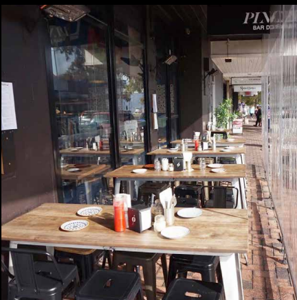
Alfresco Oxford Street

Includes inside & both alfrescos on Oxford & Newcastle street - 70 pax