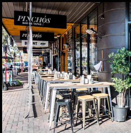
Alfresco Newcastle Street